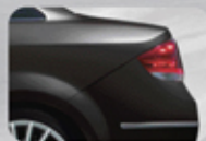
*Bronzo Scuro NEW