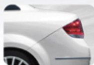
*Bossa Nova White