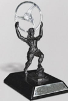
Mid Size Car of the Year, 2010 - NDTV Profit