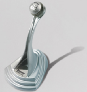
Mid-Size Car of the Year, 2009 - CNBC Overdrive