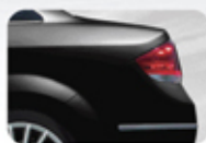
*Hip Hop Black