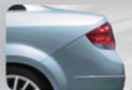
*Fox Trot Azure