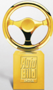
Reader's Choice Car of the Year, 2010 - Auto Bild