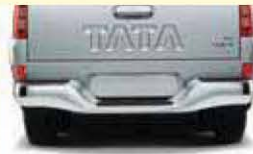
CHROME REAR NUDGE GUARD